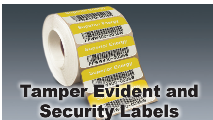
Tamper Evident and Security Labels